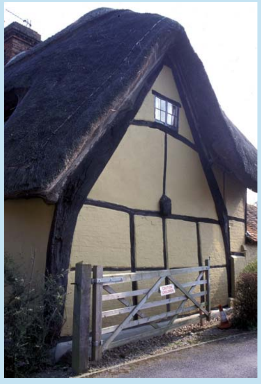
Figure C A surviving cruck frame in Harwell (Oxfordshire).

In towns, houses built to this standard plan could be built on the street frontage of a burgage plot if it were wide enough. But where plots were narrow or subdivided because of pressure for space (e.g. in the central part of Burford near the Tolsey), this plan had to be modified. Some owners built a taller house, while others created space by building back along the plot. In both cases, a side passage provided light and access.