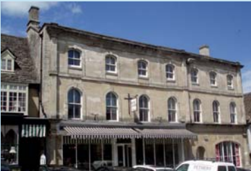
Nos. 128-132 (coloured red on the plan) still fill a complete 3-perch burgage plot. No. 134 next door (coloured yellow) was recorded as a half-burgage c.1250.

Town-plan analysis relies on the fact that the property boundaries which define urban house-plots (usually known as burgages in medieval towns) are extremely conservative and change very slowly. Thus, while ownership of a burgage plot might change through inheritance and purchase, and while it might be subdivided or otherwise developed by various owners, its original, primary boundaries are unlikely to alter. This is due partly to the difficulties of moving boundaries in a built-up area without modern construction machinery, and partly to the legal rights associated with burgage tenure. Excavations in cities such as York and Southampton have shown that some plot boundaries survived unchanged for a millennium or more, carefully marked out using hedges, fences or walls.