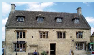
No. 33 High Street (coloured green on the plan) straddles two original 1½-perch plots.

Burgage plots along High Street, running south from Sheep Street (opposite page), and between Church Lane and Witney Street (above). Modern boundaries are shown on the left, and reconstructed medieval plots on the right.